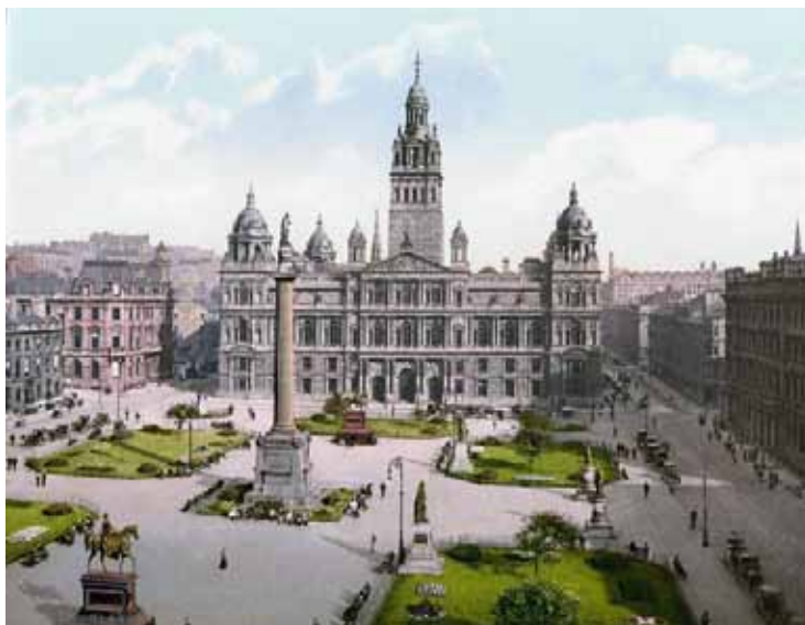
George Square and the City Chambers (c.1890)

But besides making ships and steam trains, Glasgow was a hub of creative ideas. Artists, designers and architects including Charles Rennie Mackintosh extended the city with radical and innovative new buildings.